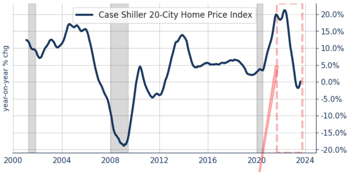
July: +0.87%, consensus: +0.9%