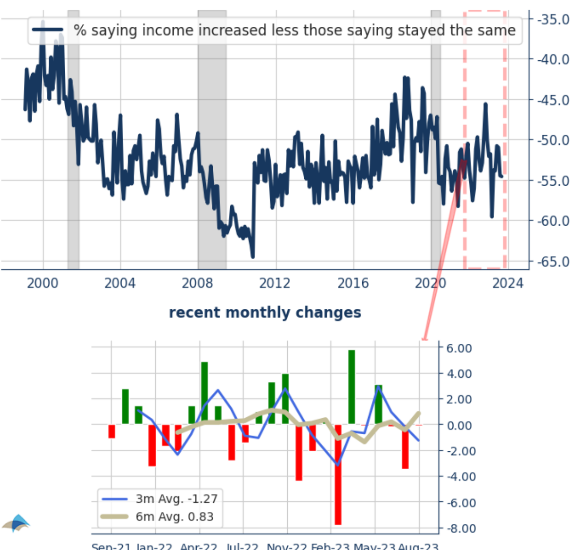
Sep-21 Jan-22 Apr-22 Jul-22 Nov-22 Feb-23 May-23 Aug-23