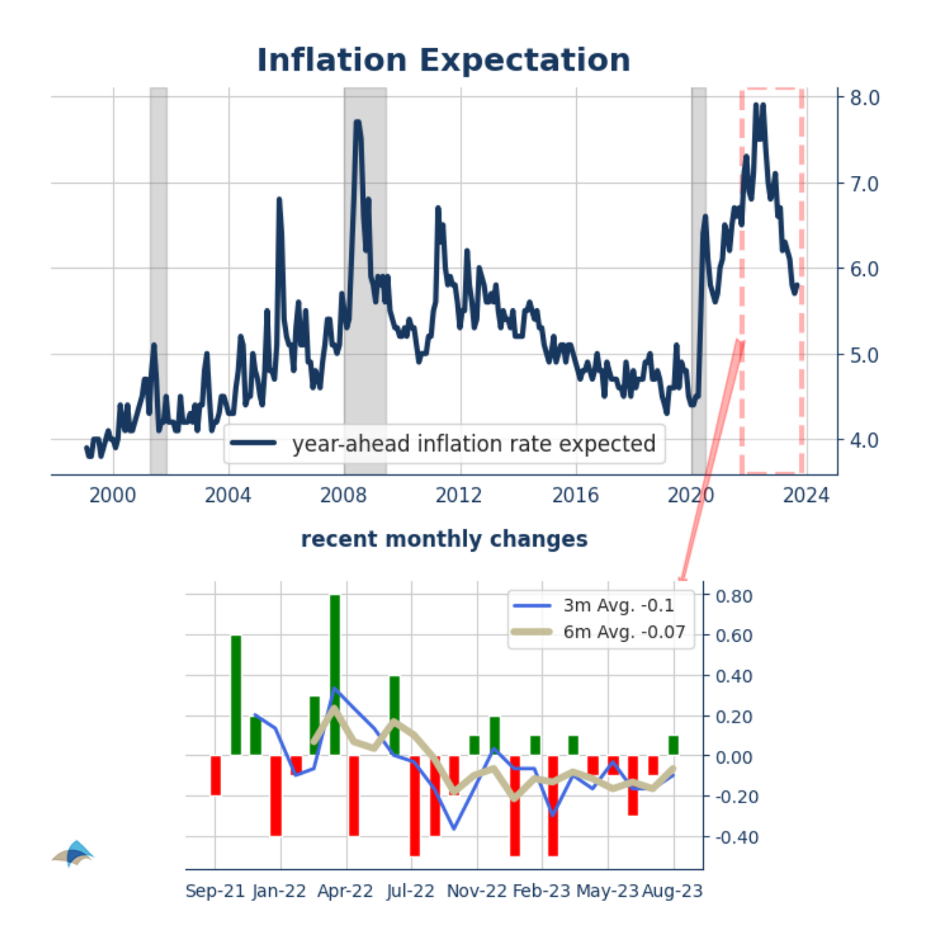
Contingent Macro Advisors 2023