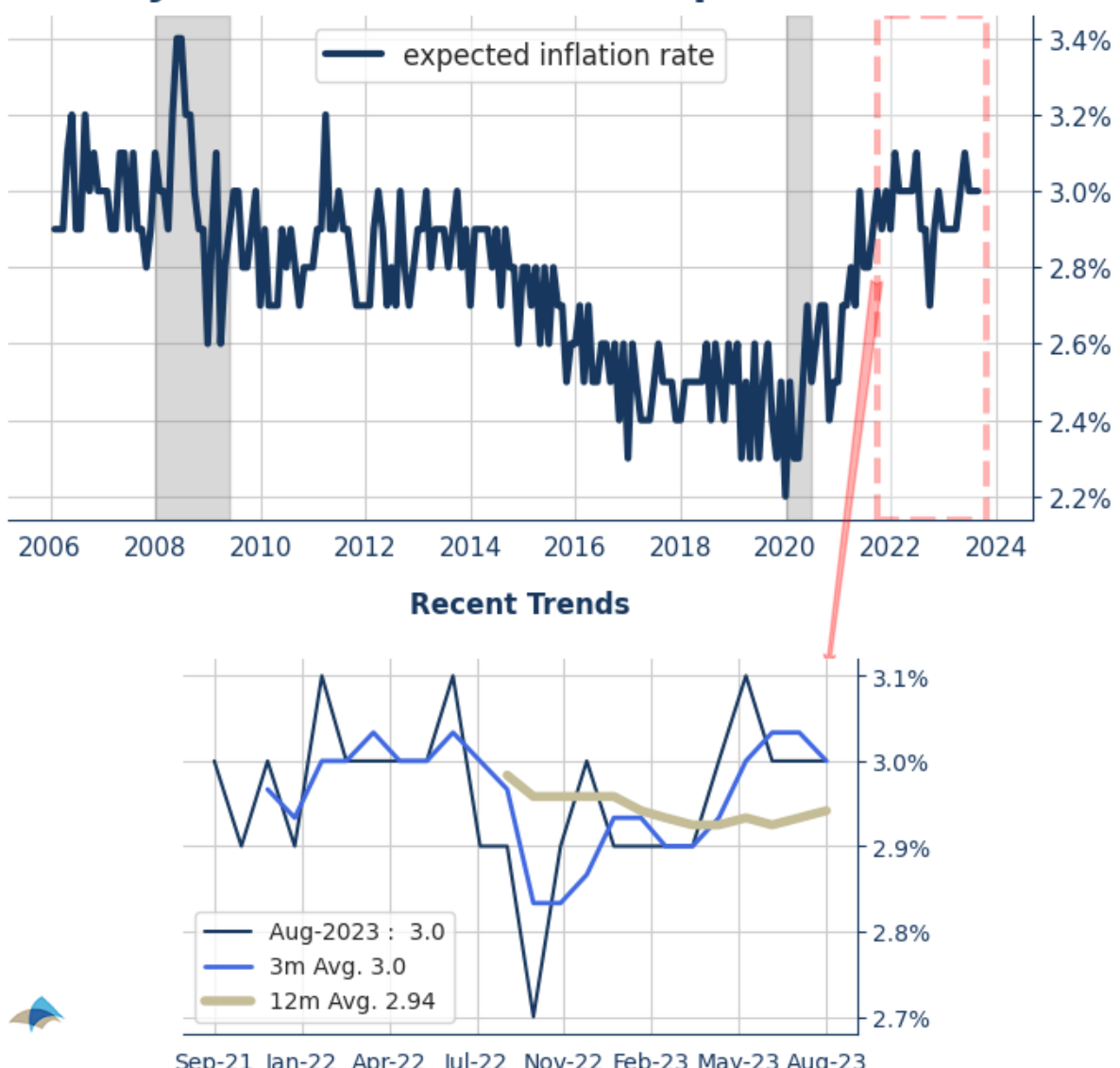
Sep-21 Jan-22 Apr-22 Jul-22 Nov-22 Feb-23 May-23 Aug-23