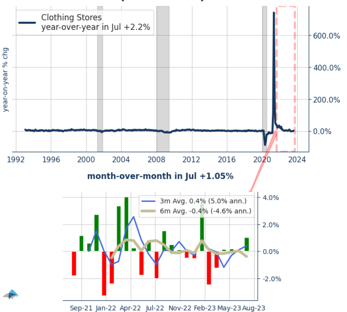
Contingent Macro Advisors 2023 source: US BEA