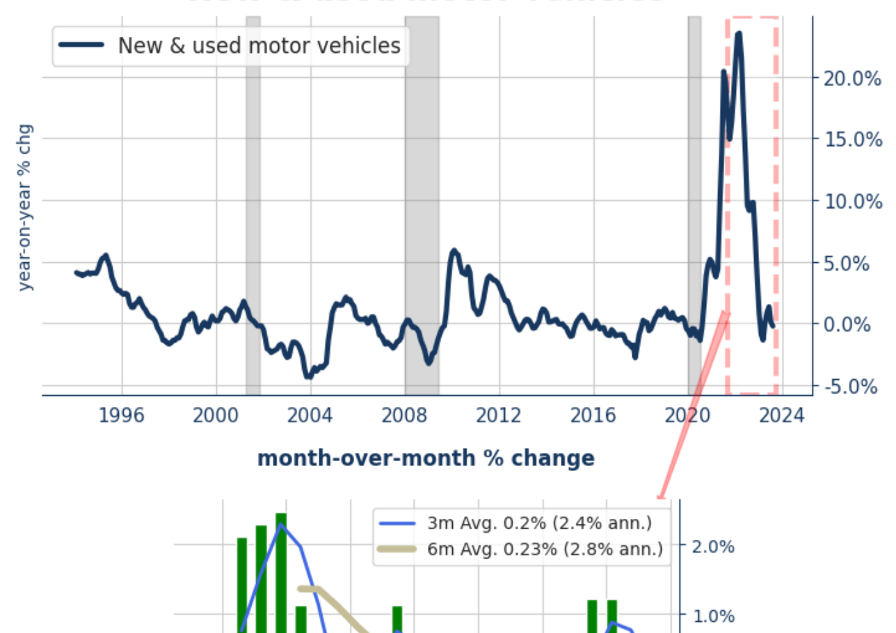
Sep-21 Jan-22 Apr-22 Jul-22 Nov-22 Feb-23 May-23 Aug-23