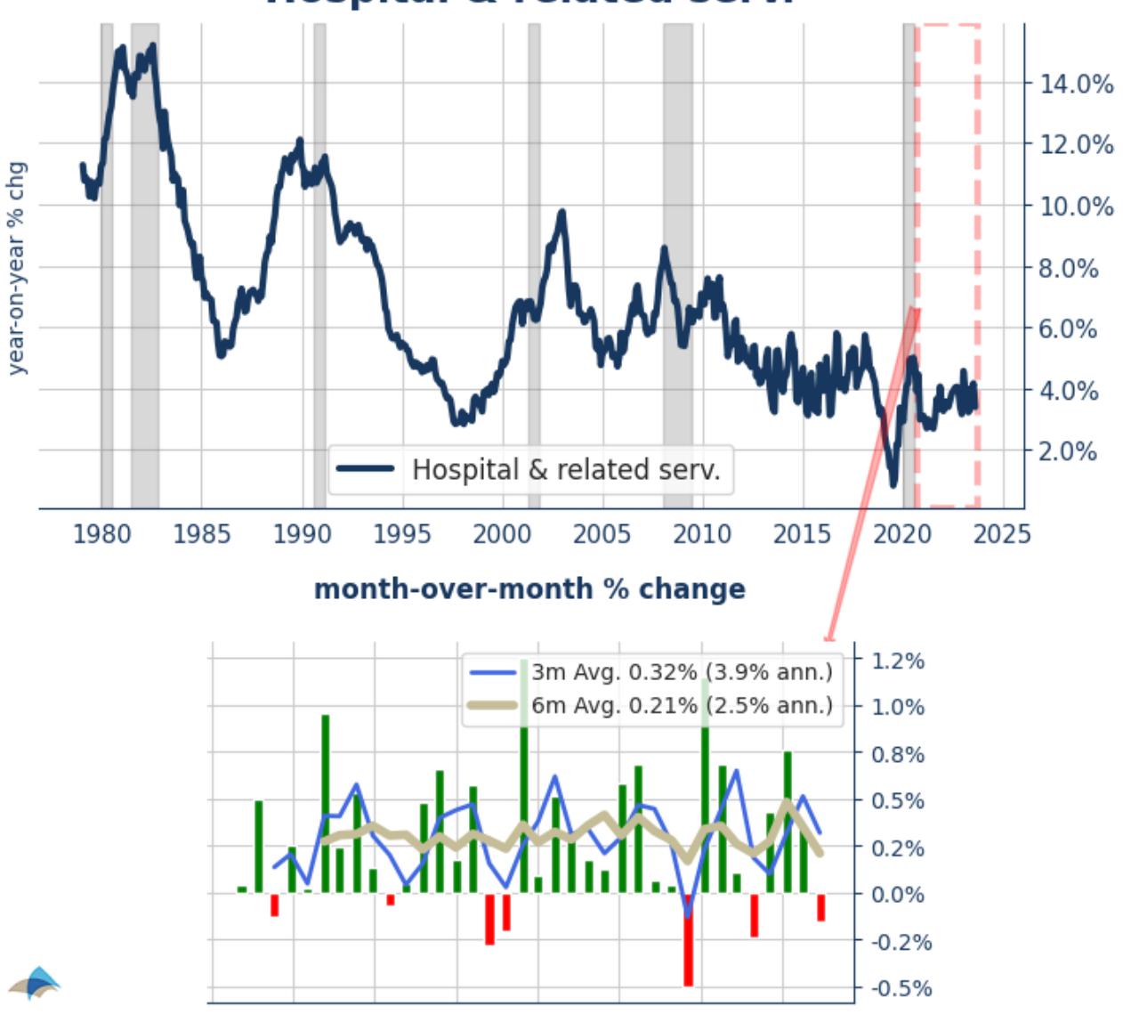
Jul-20 Dec-20 May-21 Sep-21 Feb-22 Jul-22 Dec-22 May-23