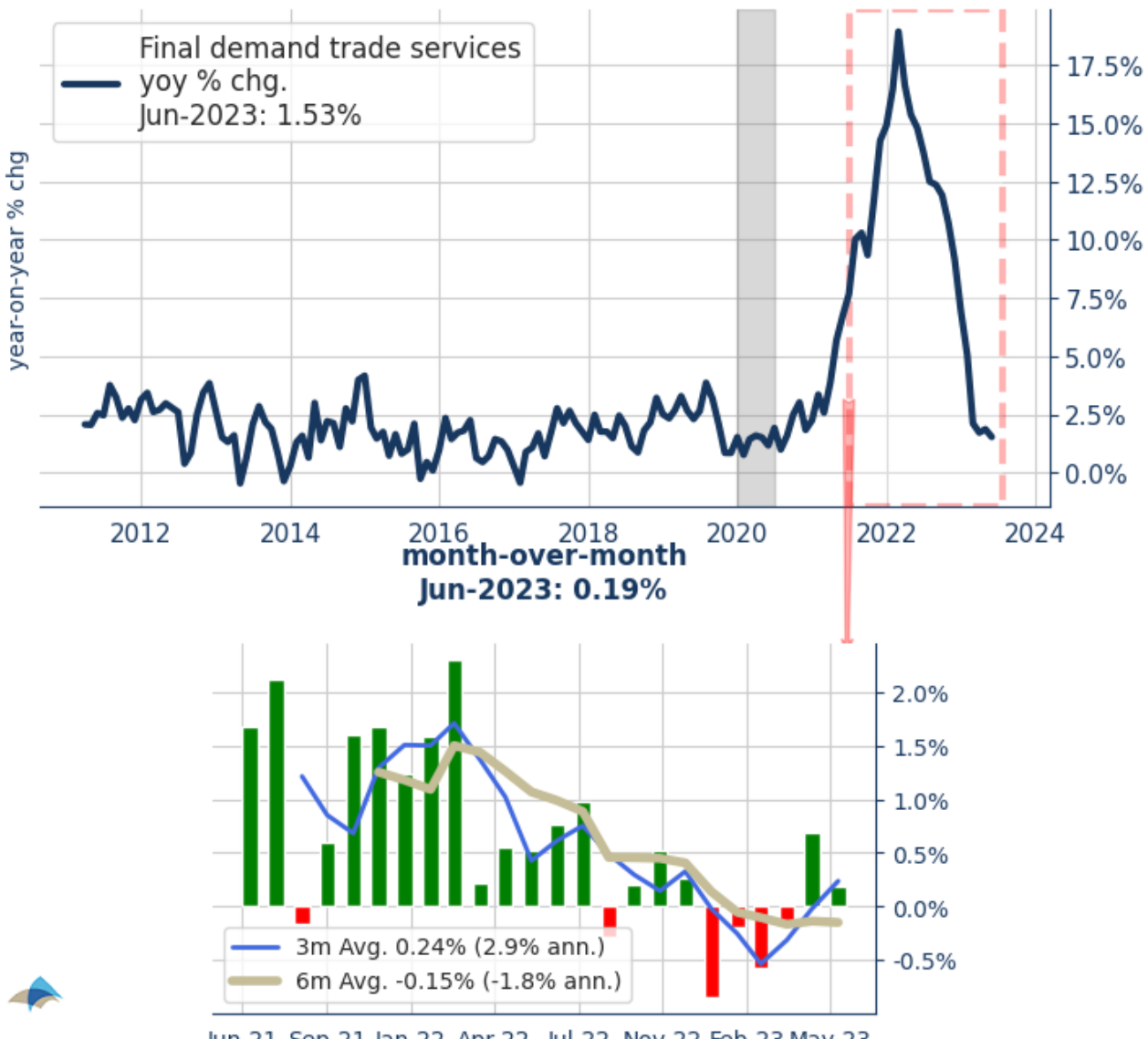
Jun-21 Sep-21 Jan-22 Apr-22 Jul-22 Nov-22 Feb-23 May-23