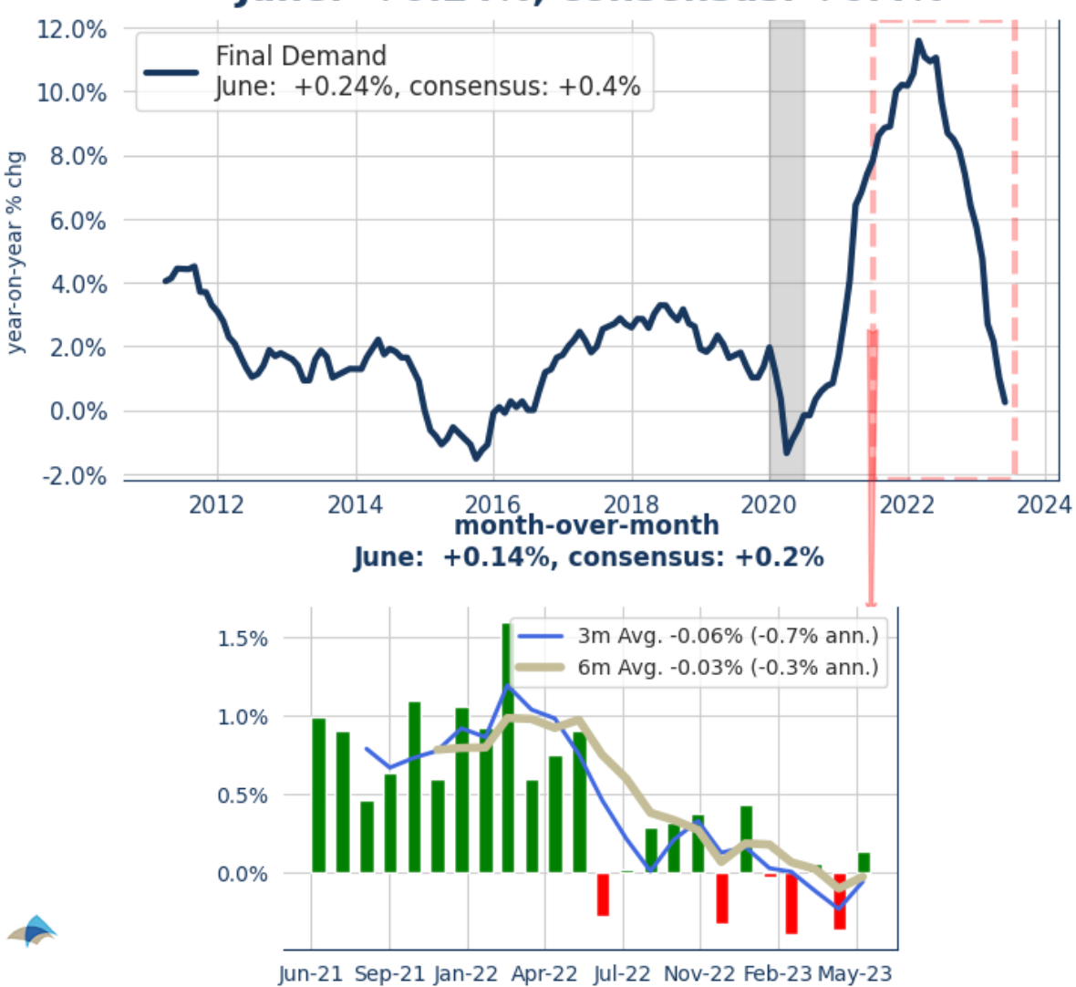
Final Demand June: +0.24%, consensus: +0.4%