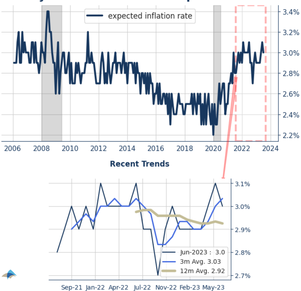
Contingent Macro Advisors 2023