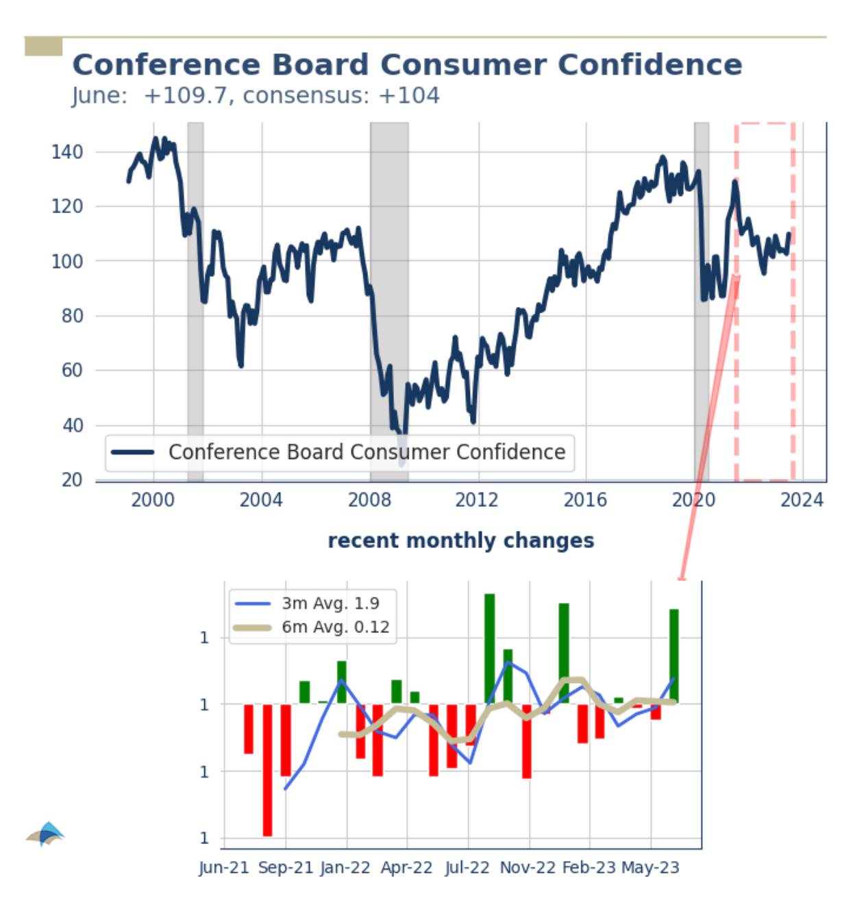
Contingent Macro Advisors 2023