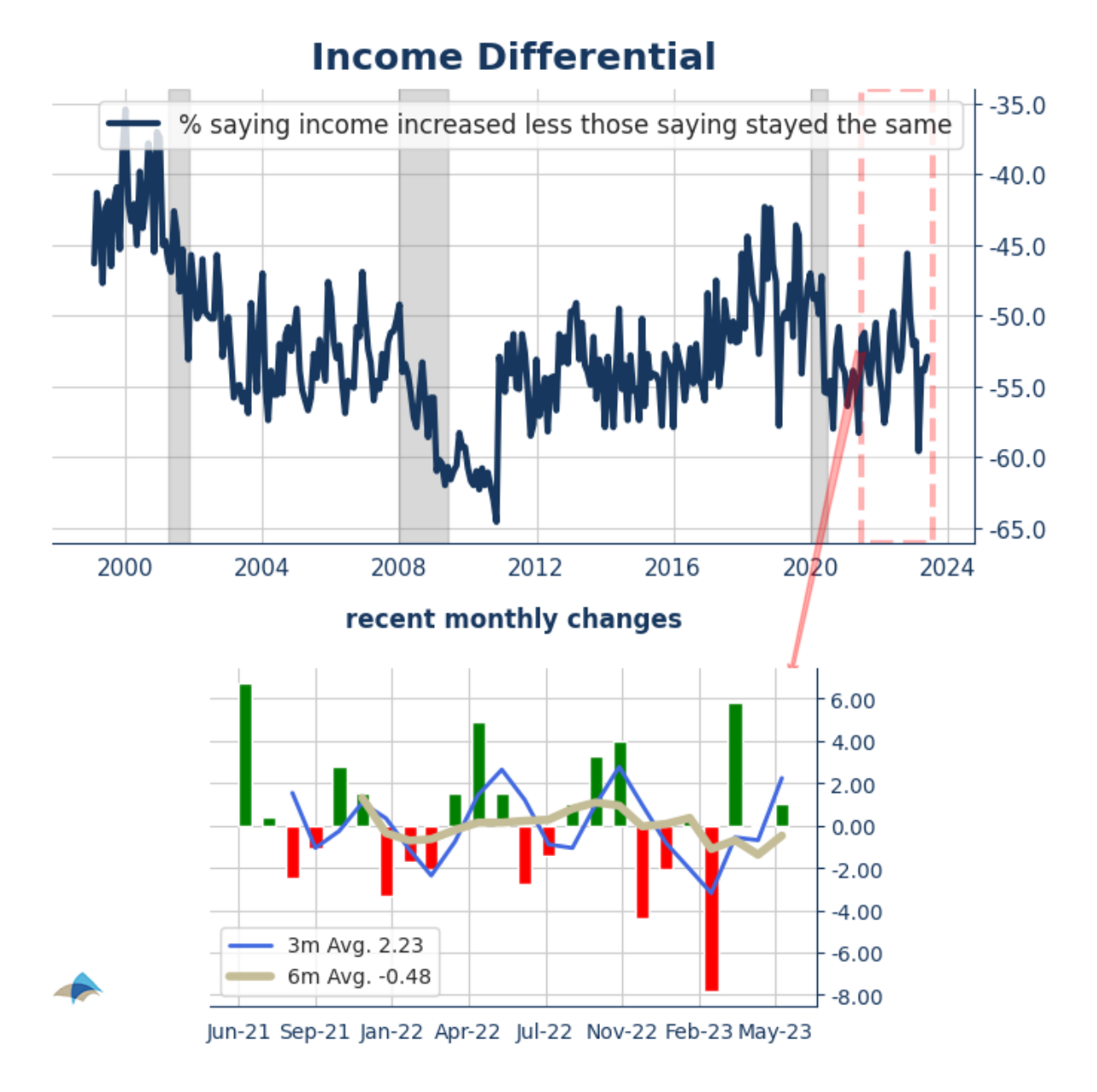
Contingent Macro Advisors 2023 source: US BEA