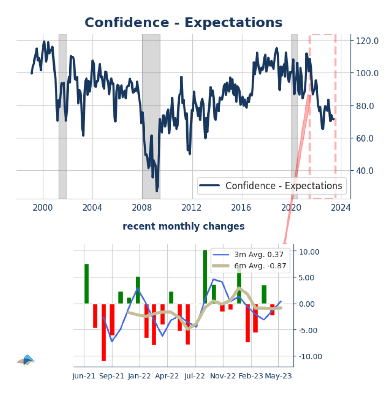
Contingent Macro Advisors 2023 source: US BEA