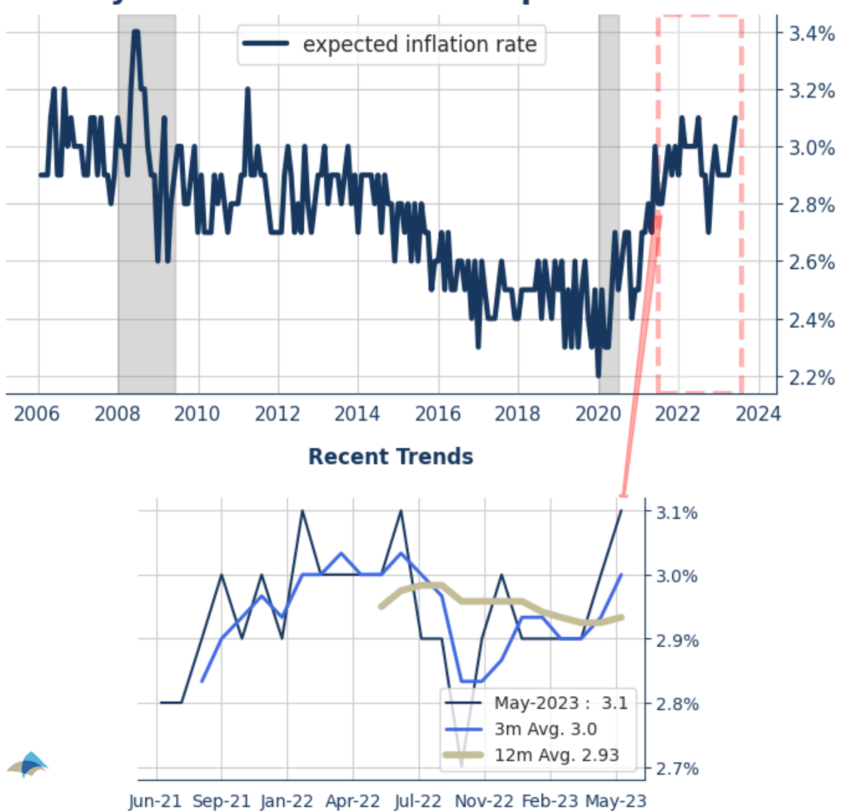
Contingent Macro Advisors 2023