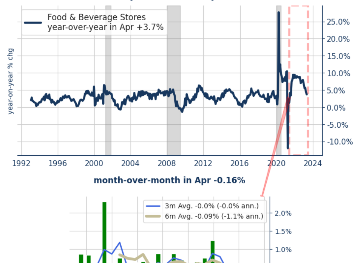
Jun-21 Sep-21 Jan-22 Apr-22 Jul-22 Nov-22 Feb-23 May-23