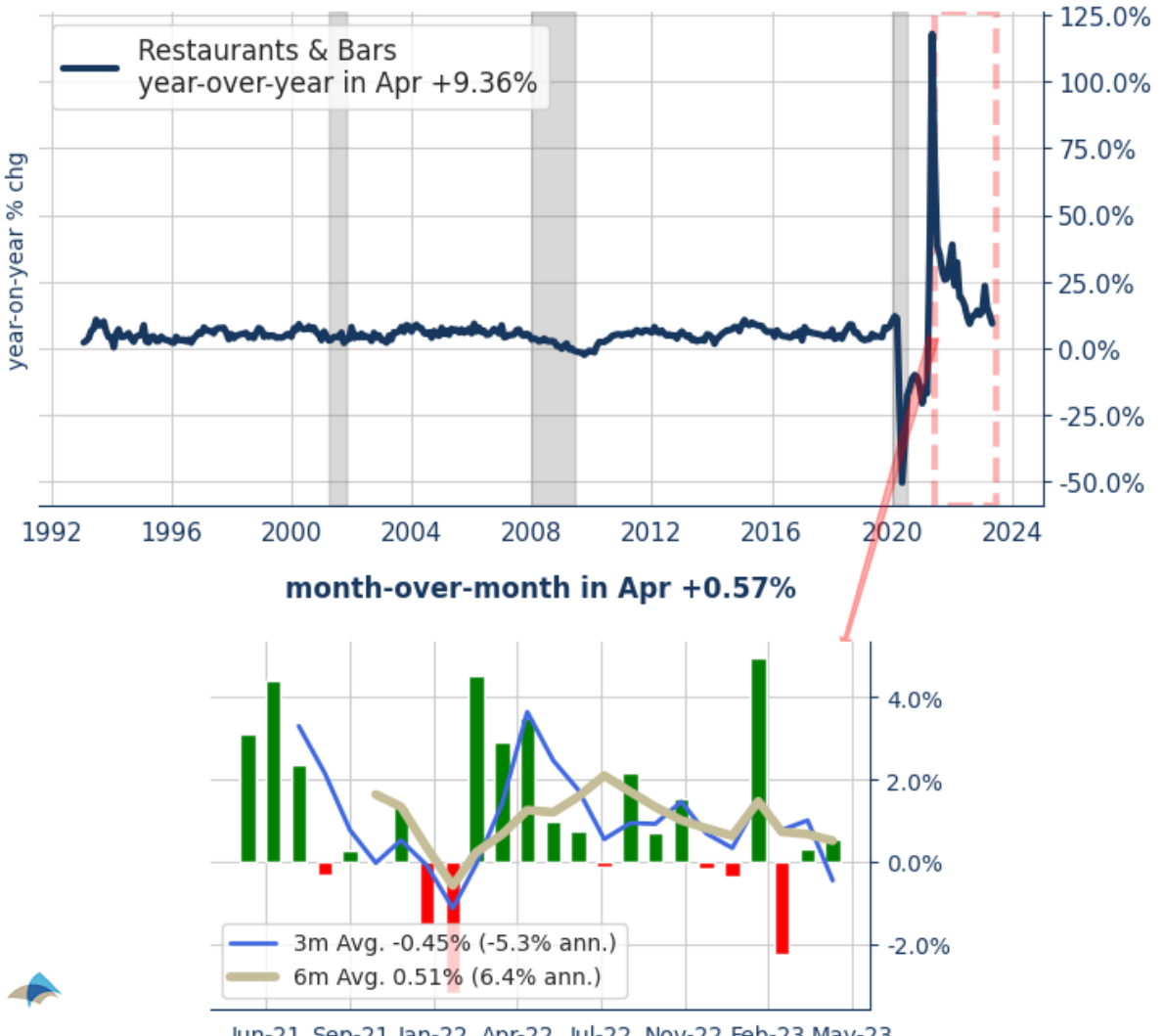
Jun-21 Sep-21 Jan-22 Apr-22 Jul-22 Nov-22 Feb-23 May-23