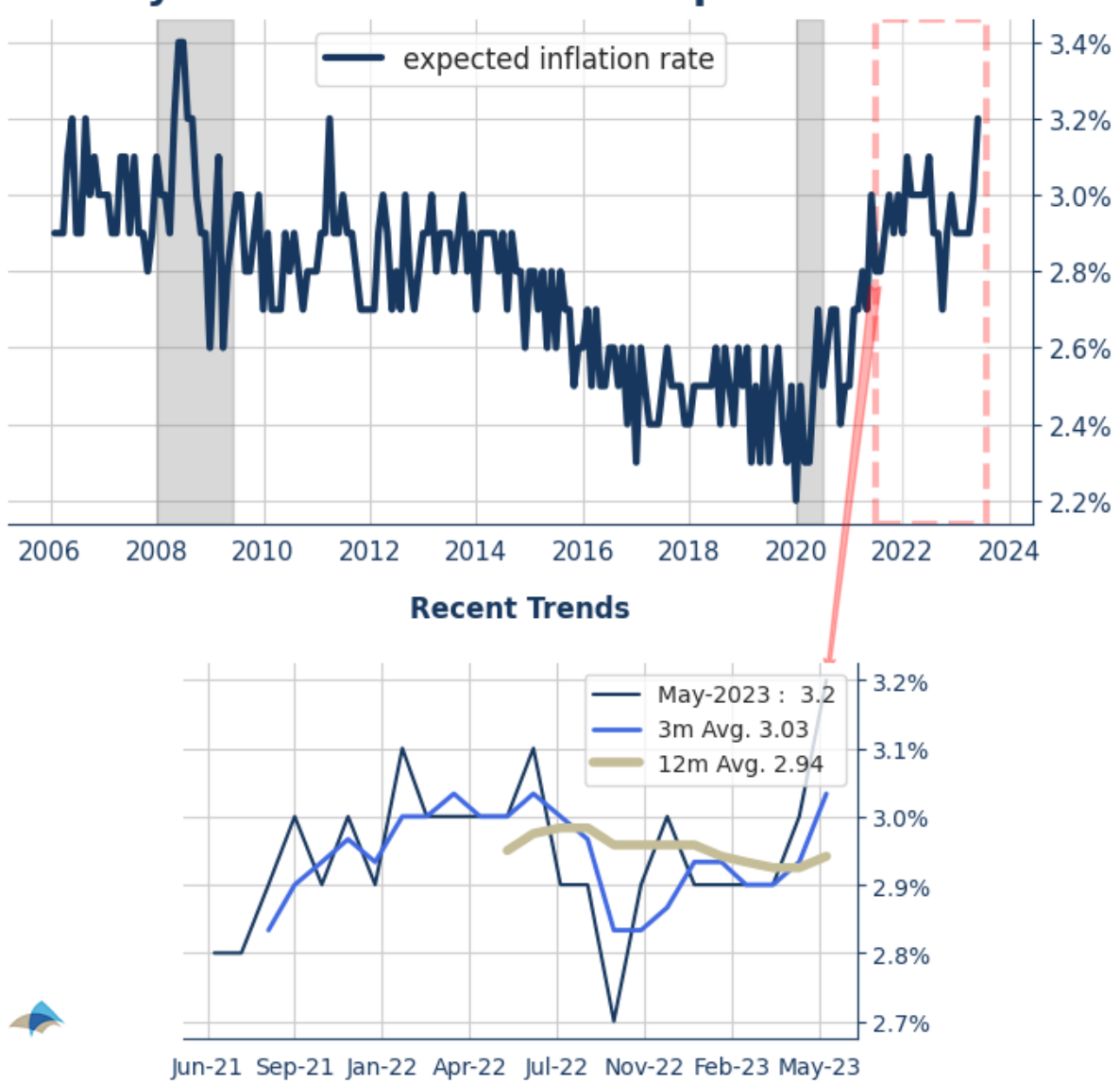
Contingent Macro Advisors 2023