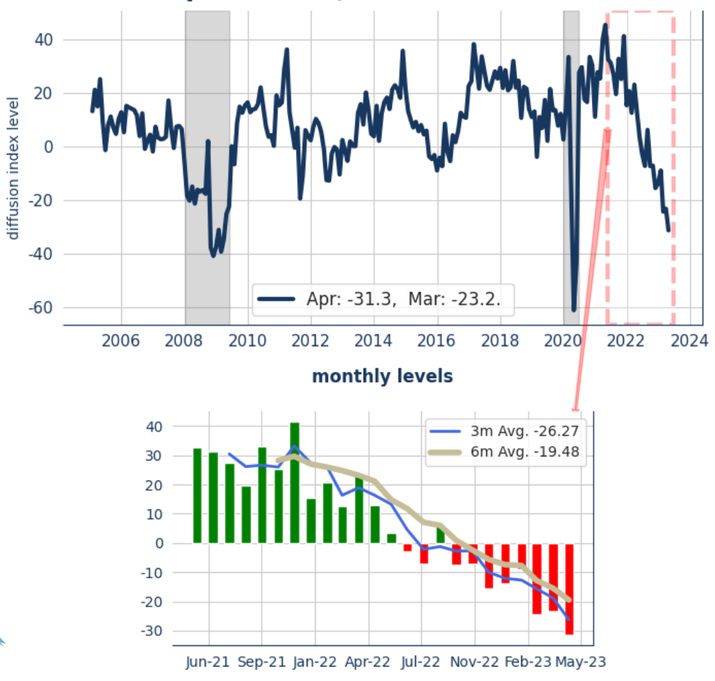
Philly Fed Current Activity Index April: -31.3, consensus: -19.3

Contingent Macro Advisors 2023 source: Philadelphia Fed. Consensus from Bloomberg LP