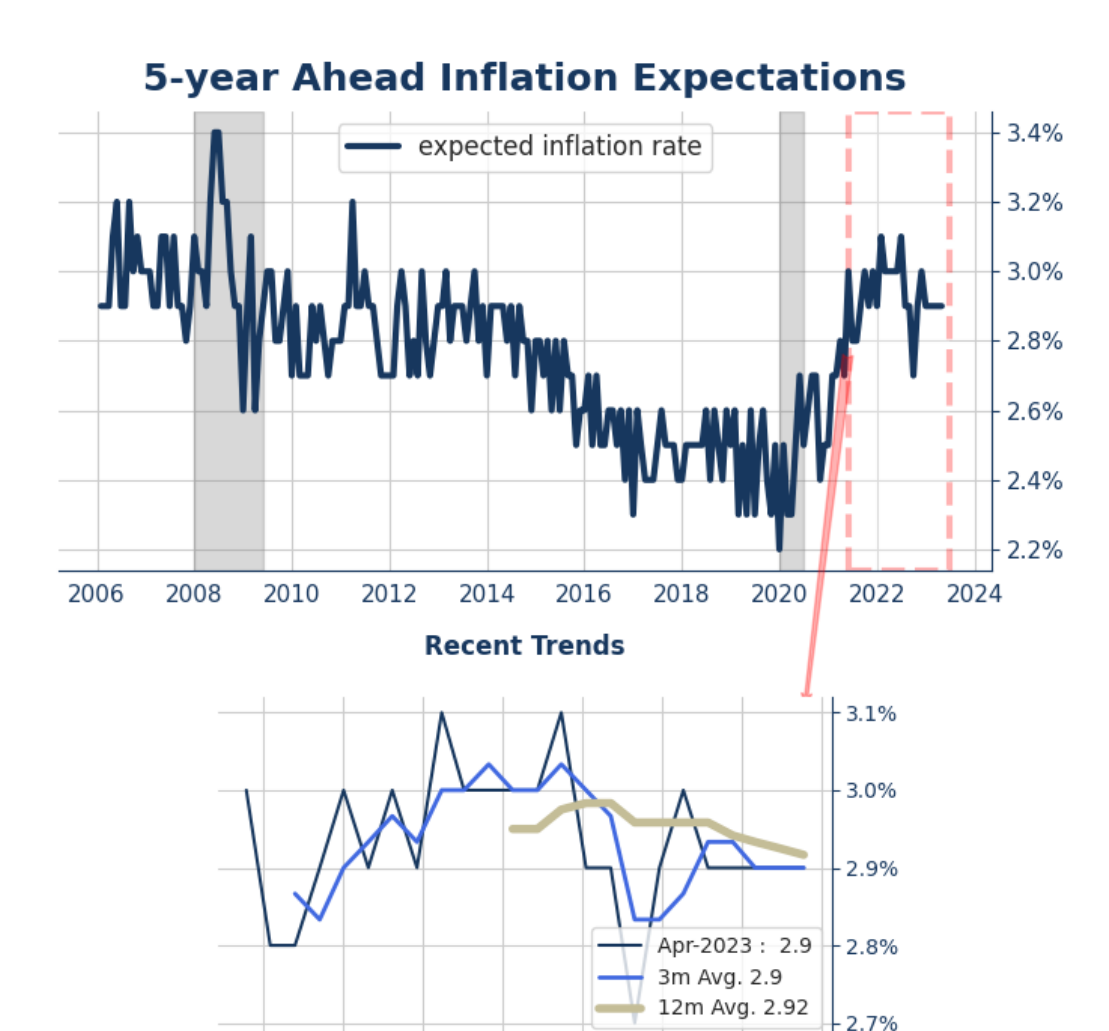
Contingent Macro Advisors 2023