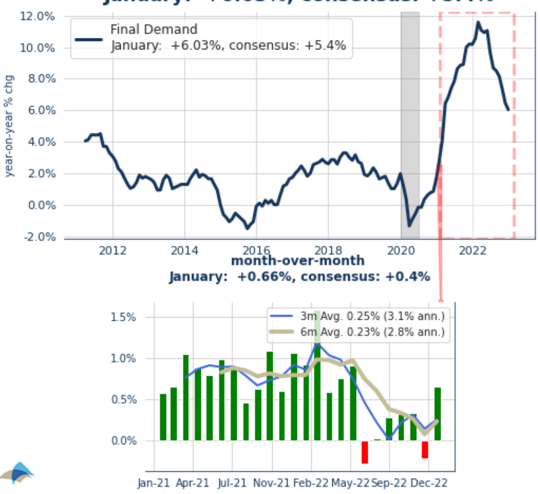
Final Demand January: +6.03%, consensus: +5.4%