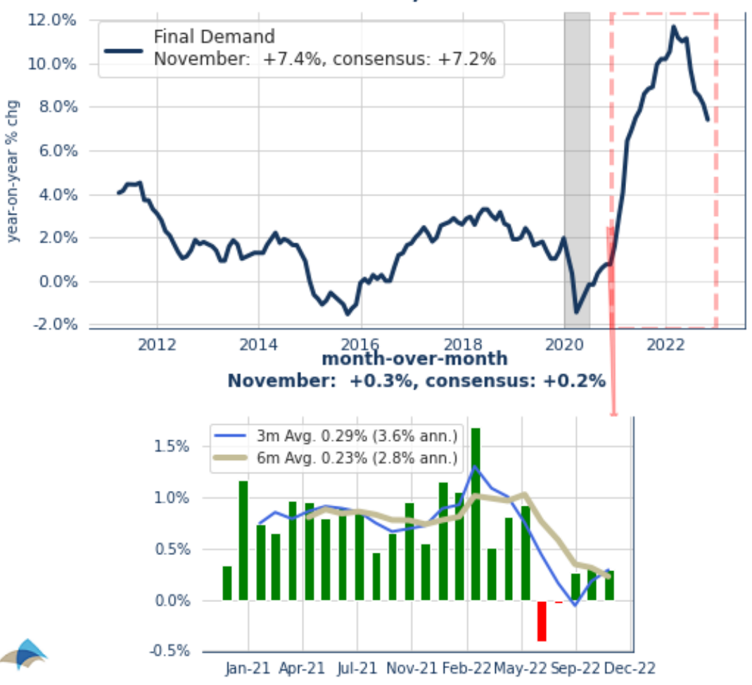
Final Demand November: +7.4%, consensus: +7.2%