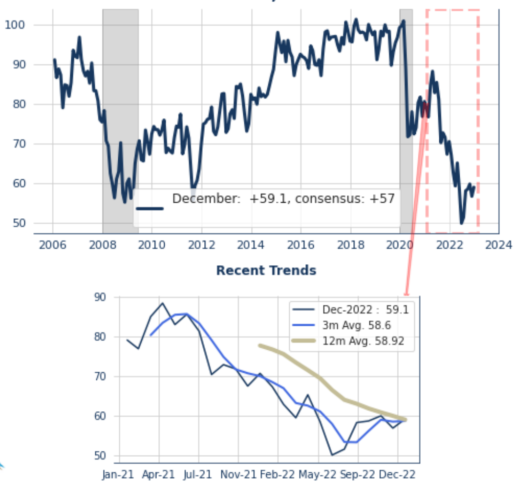
U. Mich. Consumer Sentiment December: +59.1, consensus: +57

Contingent Macro Advisors 2022 source: University of Michigan