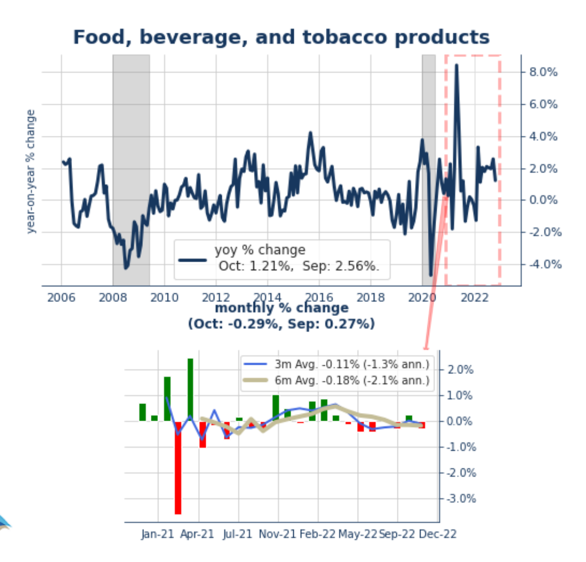
Contingent Macro Advisors 2022