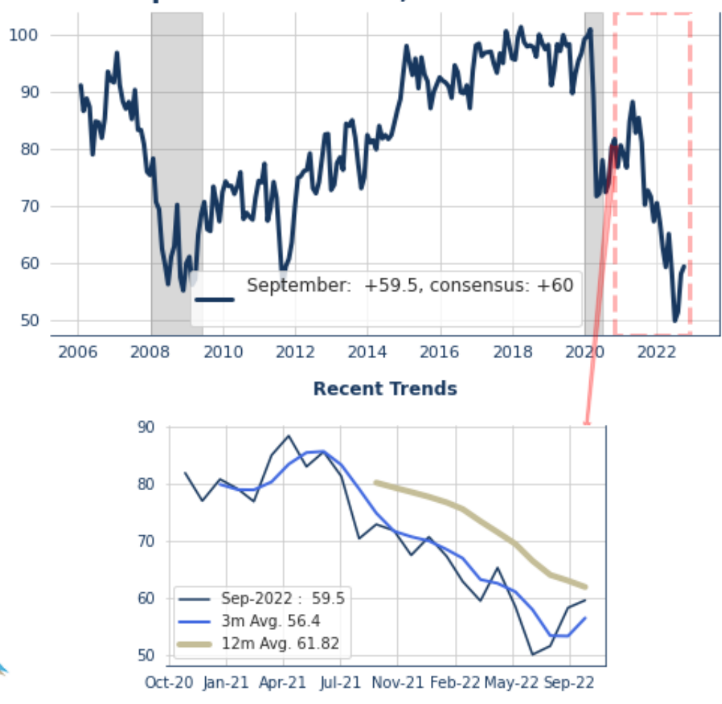
U. Mich. Consumer Sentiment September: +59.5, consensus: +60

Contingent Macro Advisors 2022 source: University of Michigan