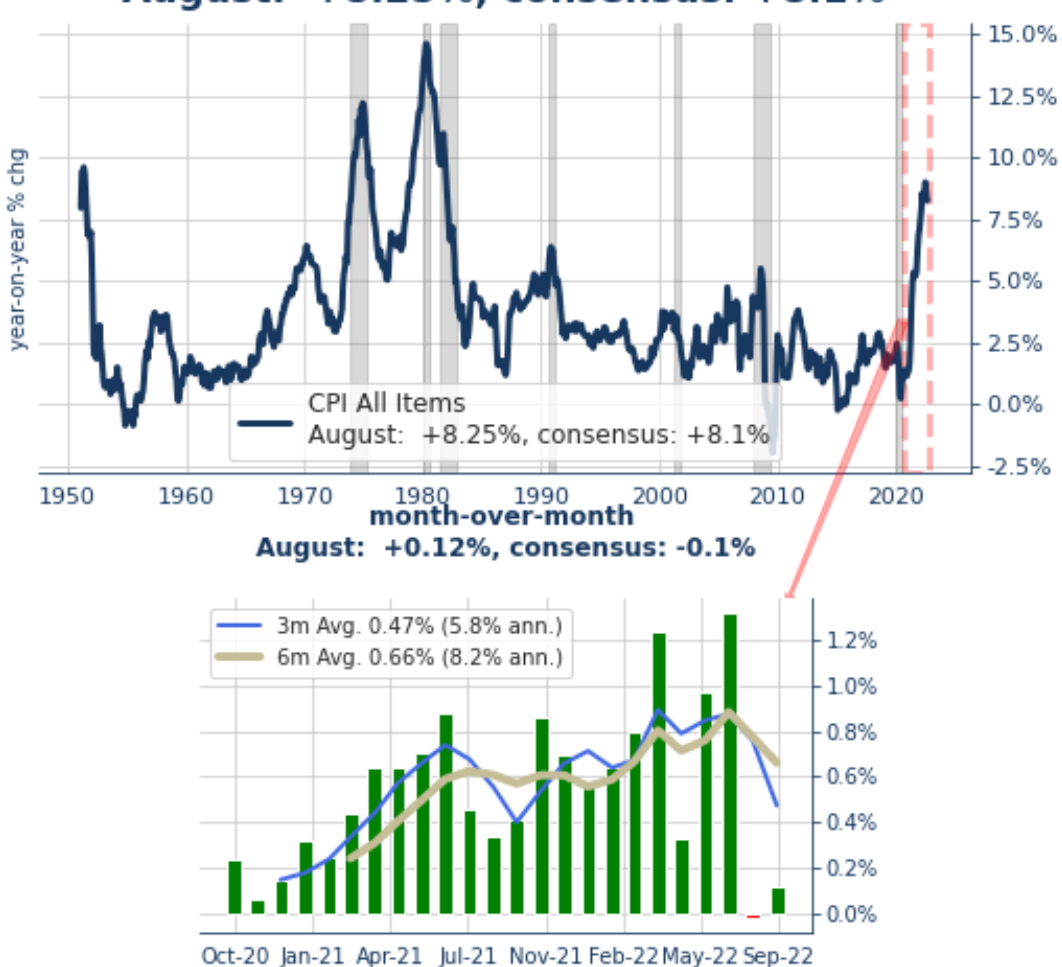
CPI All Items August: +8.25%, consensus: +8.1%