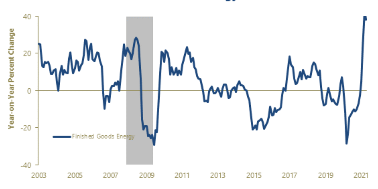
PPI , Energy